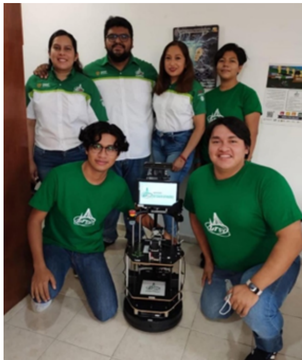
Fig. 2. Olmeca Team 2021.

The Olmeca team of the Universidad Tecnológica del Sureste de Veracruz was created in March 2021 with the purpose of participating in robotics competitions nationally and internationally, where its first participation was in the Robocup 2021 Japan in the major league @Home, where It was possible to acquire knowledge and experience for future events, in addition to the fact that the same team members were trained by doctors and teachers related to the subject of robotics, granting the bases and skills to function in the competitions as well as in the area.