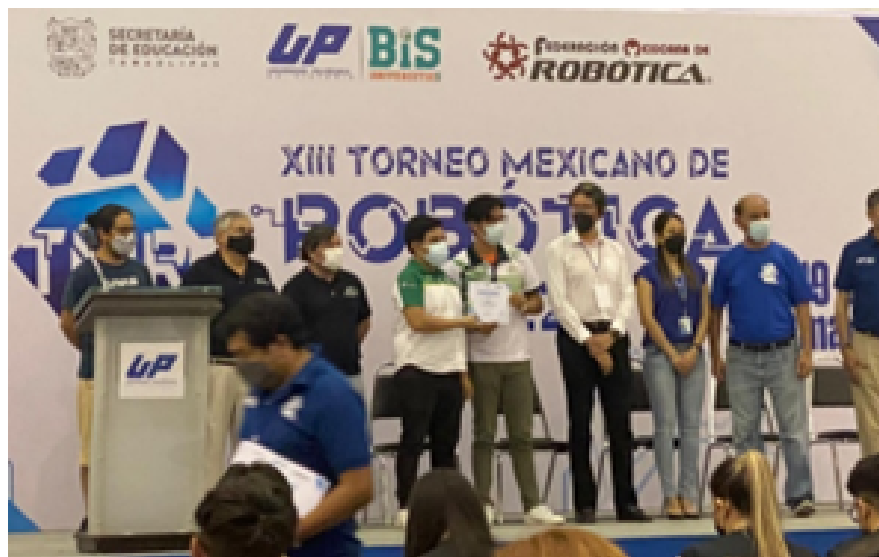
Fig. 3. Olmeca Team in TMR 2022.

In 2022 the team participates in the Mexican Robotics Tournament in the @Home category where we had a good performance in the "Test in Stage I" and "Test in Stage II" tests. The Olmeca team gained a recognition to the best poster in this event.