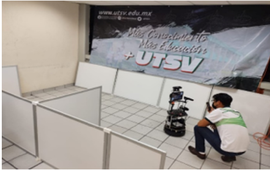
Fig. 4. Member of Olmeca Team 2022.